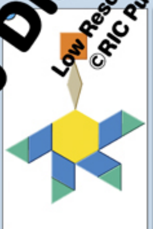
Make a pattern block person from another planet.