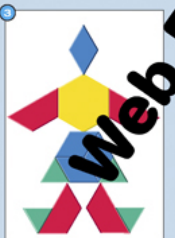
Show another member of the Pattern Block Man family.