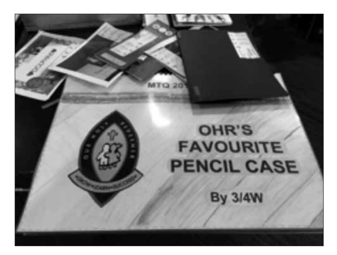
Figure 1. Investigation on favourite choice of pencil case (Year 3–4 students).

activities, such as studies investigating the most popular type of pencil case within a class (Figure 1), or an analysis of how much sugar could be found in favourite foods (Figure 4), to mathematical investigations exploring the cost of refurbishing a dream house, or the relation of the moon and space travel. Findings were presented and reported using a combination of visual aids, reports, mathematical workings, models and diagrams.