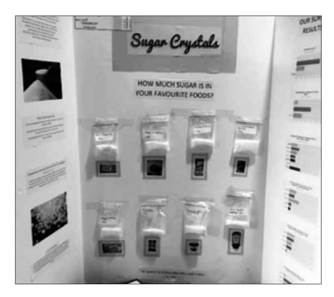
Figure 4. Visual aid to accompany investigation on how much sugar is in your favourite foods (Year 4).

learners for their effort and hard work in presenting their mathematical understandings. On reflection, however, some entrants had missed out on valuable steps during their investigative process, or not provided substantial reflections, and therefore needed to be marked accordingly to aid their future learning. Despite this, most entries showed evidence of all four proficiency strands: understanding, fluency, problem solving, and reasoning (ACARA, 2016). This suggests participants had the opportunity to cover the appropriate areas of the curriculum for their year level, and were improving their mathematical capabilities and skills.