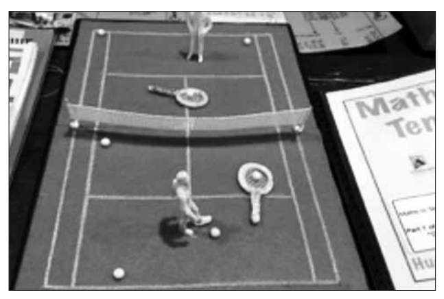
Figure 3. Model to accompany project on the use of mathematics in tennis (Year 3).

A Year 1 student produced a project entitled Toy Car Science. This investigation was presented as a poster with separate sections including results and graphs, and headings, "What did I do?" and "What did I learn?" The aim of the investigation was to see how far a toy car would travel depending on how far it was pulled back. The student pulled the car back at 3 cm intervals, repeating the test twice for each distance, then plotted the data into a table and column graph. There was no attempt to arrive at a prediction or hypothesis about the results. When comparing this investigation to that of a student in a higher year level, it seems that the concept of mathematical investigation is relative to what is important in a child's life. Whether it be how far the toy car travels, or the mathematics involved in playing netball, the main link was how students related the mathematics involved in their real-life activities. In the projects produced by higher year level students, there was more evidence of provocation and a hypothesis formed, as well as suggesting alternatives to further the investigation.