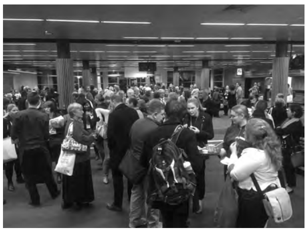
Delegates mingling at the President's Reception.

AAMT's next biennial conference will be held in Brisbane in July 2019—watch out for details!