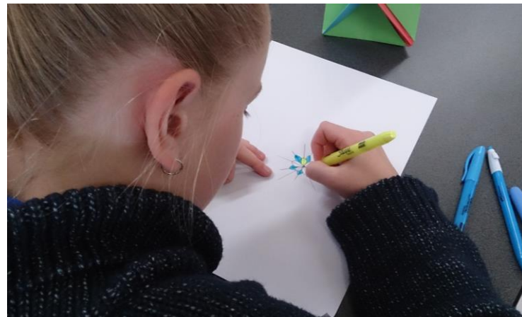
BURNIE Sunday 28<sup>th</sup> October, 12 – 4pm Burnie High School